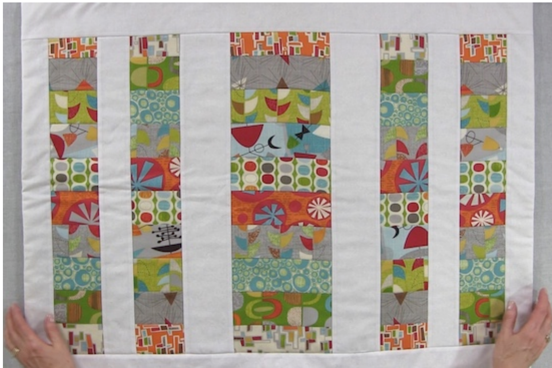
Table Topper: approximately 25" x 32"

It would be a shame to damage your cabinet after all your hard work restoring it to its former beauty. It would be nice to have something attractive that you could put on the cabinet to protect it from the sun and scratches from cats. A table topper is the perfect protection for your cabinet. This pattern is for a simple “quilt-based” project that will let you practice with your newly restored machine while creating an attractive cover for your cabinet.