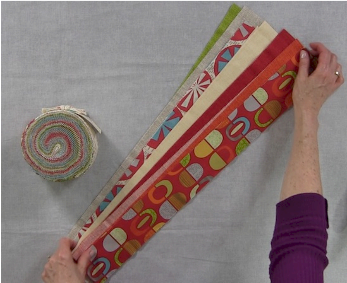
Jelly Roll Strips