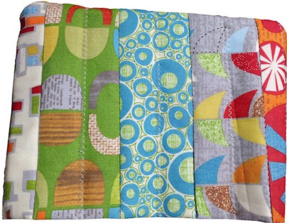
Bed Extension Cozy: Approximately 6" x 8"