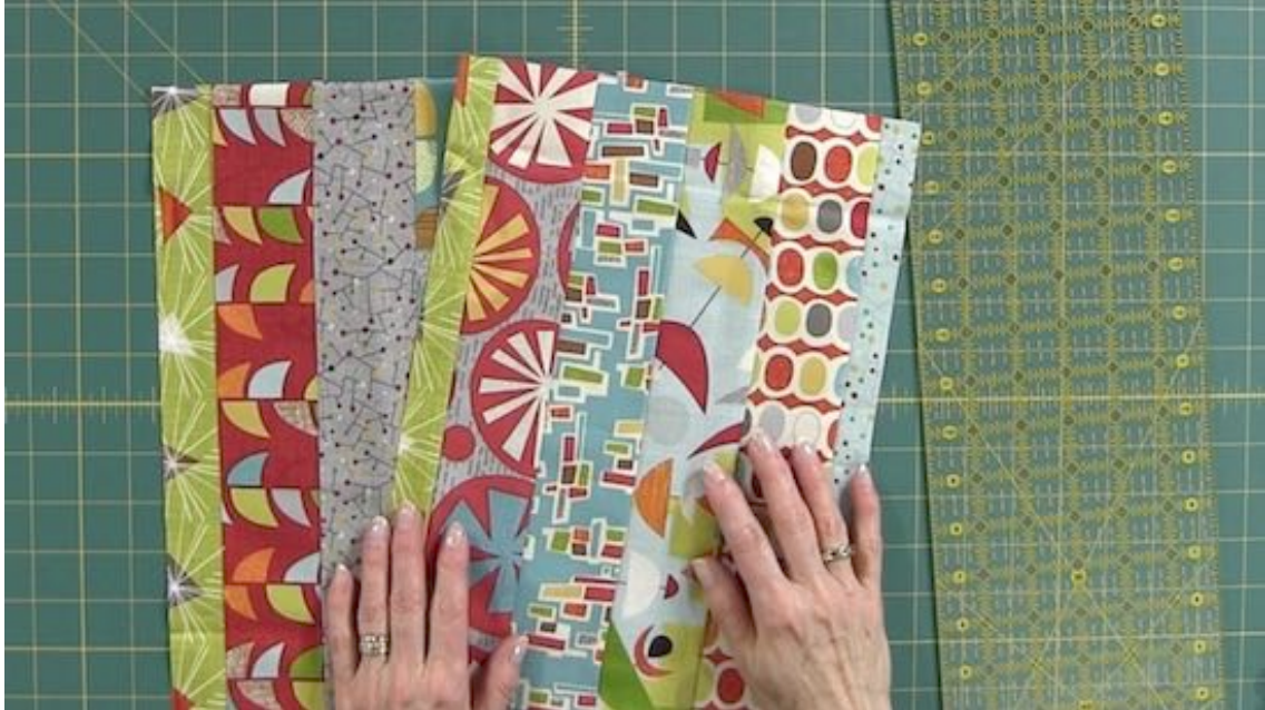
Two Pieces 9½" x 13"