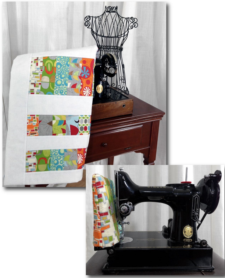
Table Topper & Bed Extension Cozy