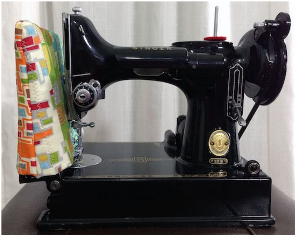
Featherweight With Cozy

Although the FeatherWeight is a fantastic compact sewing machine there is one design flaw that is really annoying to those of us who care about the appearance of our machines. When the bed is raised, so that the machine will fit in the carrying case, the screw on the face of the head rubs against the surface of the bed. Let's use Fat Quarter strips to create a cover to protect the extension bed.